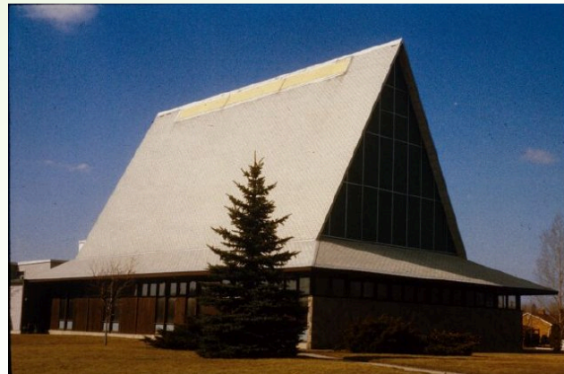
Above: Harcourt Memorial United Church, Dean Avenue, Guelph, 1977.

The Harcourt Memorial United Church has been the gathering place of the Rainbow Chorus of Waterloo-Wellington for over 20 years. In 2005 Harcourt became an Affirming Congregation, embracing and affirming people of all sexual orientations and gender identities. They were one of the first churches in the community to make this commitment to inclusivity and belonging.