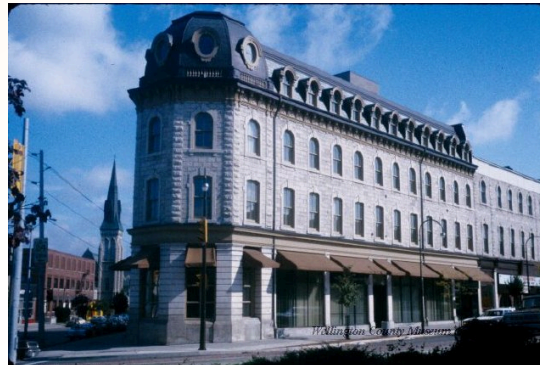
Above: 157-145 Wyndham St, 1984.

Out on the Shelf began in 1997 as a collection of donations kept in a basement in the University of Guelph's MacKinnon building. The library officially opened in 2005 when it was given a space on the second floor of the Canadian Mental Health Association (CMHA) building at 147 Wyndham St. Since then, it moved to the Matrix building, but was forced to move suddenly and place its collection in storage until its move to 10C at 42 Carden Street, where it is now situated.